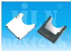
TW7421 and DS1139 series SD-card and micro-SD card holder SMT, push/push model (gold flash leads, horizontal SMT type)