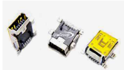
DS1104 series mini-USB-B connector SMT (PCBoard socket type, in tape & reel)