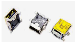
DS1104 series mini-USB-B connector SMT (PCBoard socket type, in tape & reel)