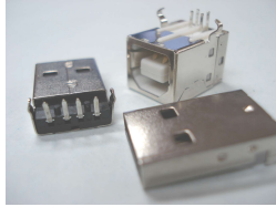
DS1090 series USB-connectors (PCBoard socket type) (tray packing)