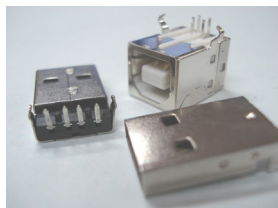
DS1090 series USB-connectors (PCBoard socket type) (tray packing)