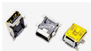
DS1104 series mini-USB-B connector SMT (PCBoard socket type, in tape & reel)