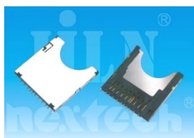
TW7421 SD-card holder SMT (gold flash leads, horizontal SMT type)